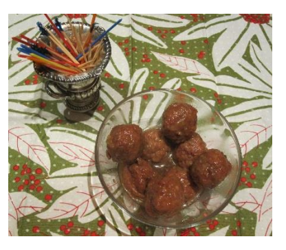
Yummy Hammy Balls